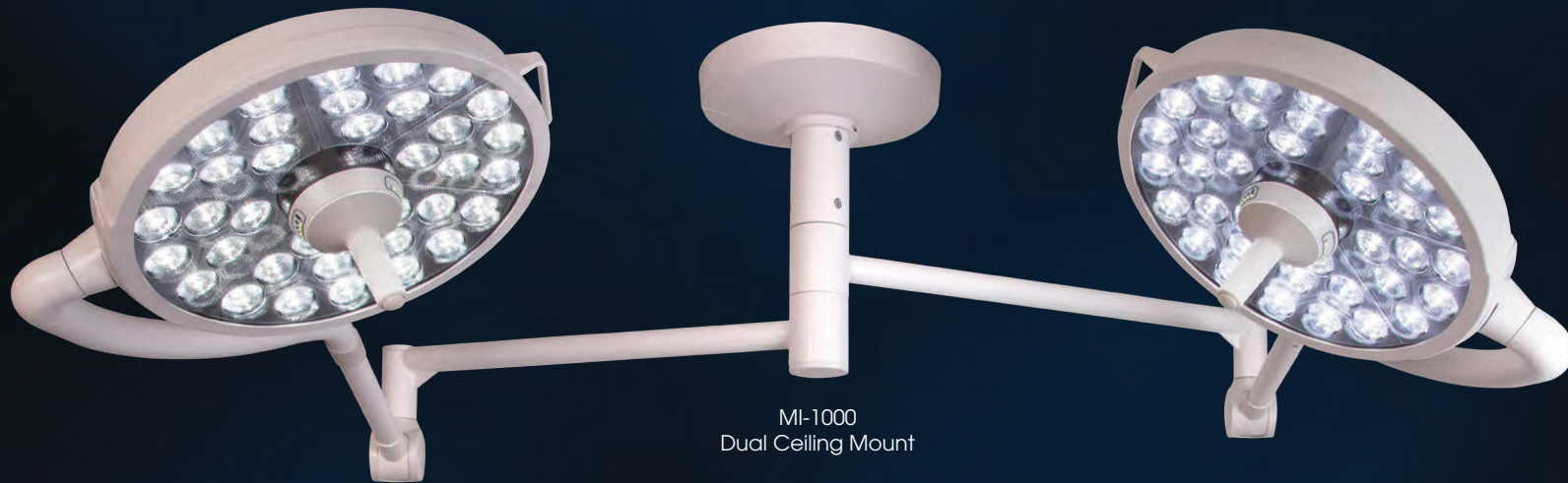
MI-1000 Dual Ceiling Mount