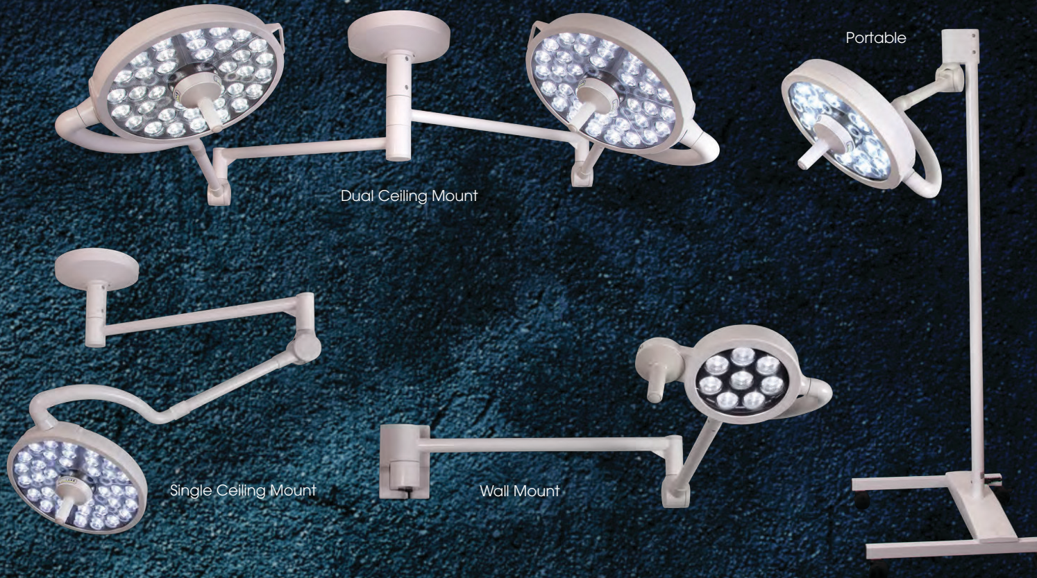
Dual Ceiling Mount