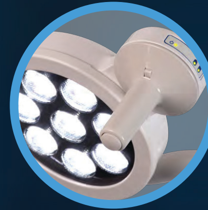
Sterilizable Handle and control grip