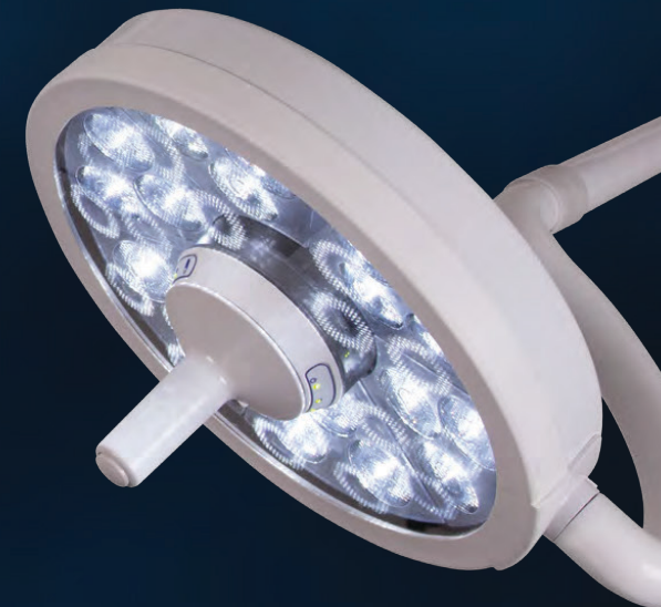
MI-750 Dual Ceiling Mount