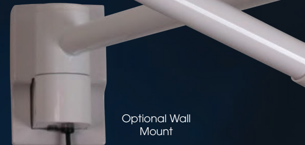
Optional Wall Mount